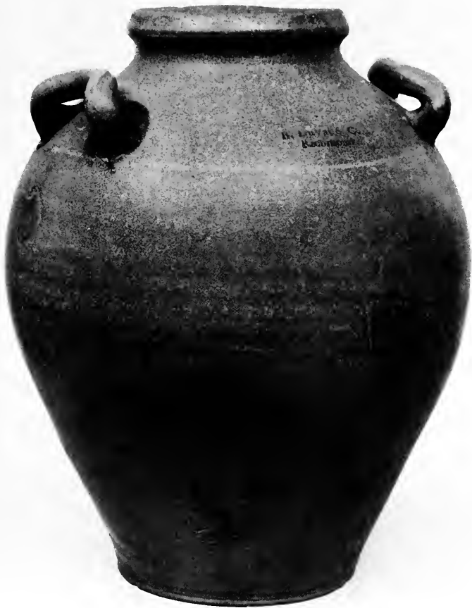
Jar by Richmond Stoneware Manufacturing; stoneware; Richmond, Va.; 1815-1817. HOA 15 \frac{3}{8} "; DIA at rim 5 \frac{3}{4} ". MESDA acc. 2950.